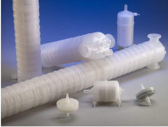
Approximate Batch Size