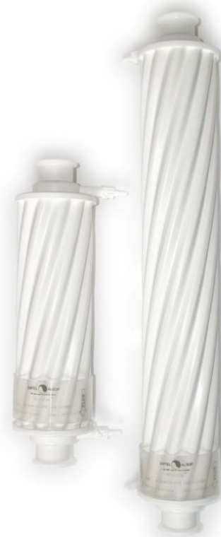
Micro-Cap™ 70 mm