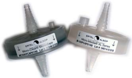
Micro-Cap™ 60 mm

The Micro-Cap™ Laboratory Filters are perfect for use in small batch processing and scale-up studies. Each Micro-Cap™ is supplied with a specification sheet packaged one Micro-Cap™ per poly-bag.